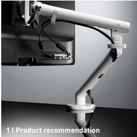
1 | Product recommendation